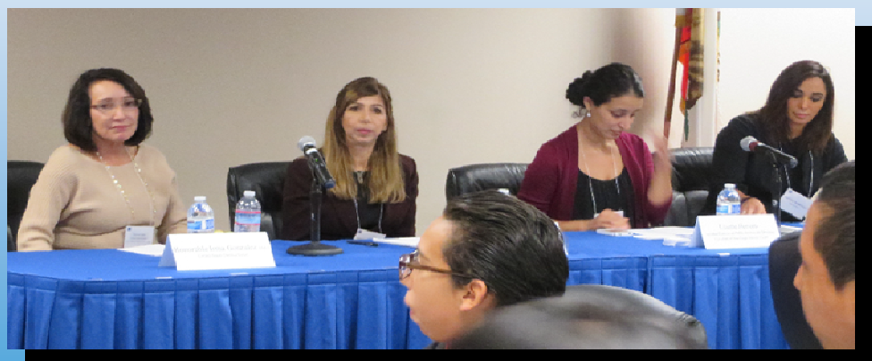
Color of Justice Panel