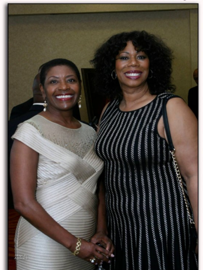
39th Annual State Conference