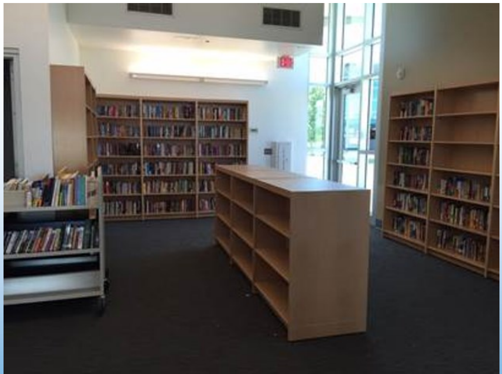
La Colinas Women's Detention Facility new library stocked with the books collected by NAWJ members.

Thank you to the NAWJ coordinators and all that contributed to this wonderful accomplishment!